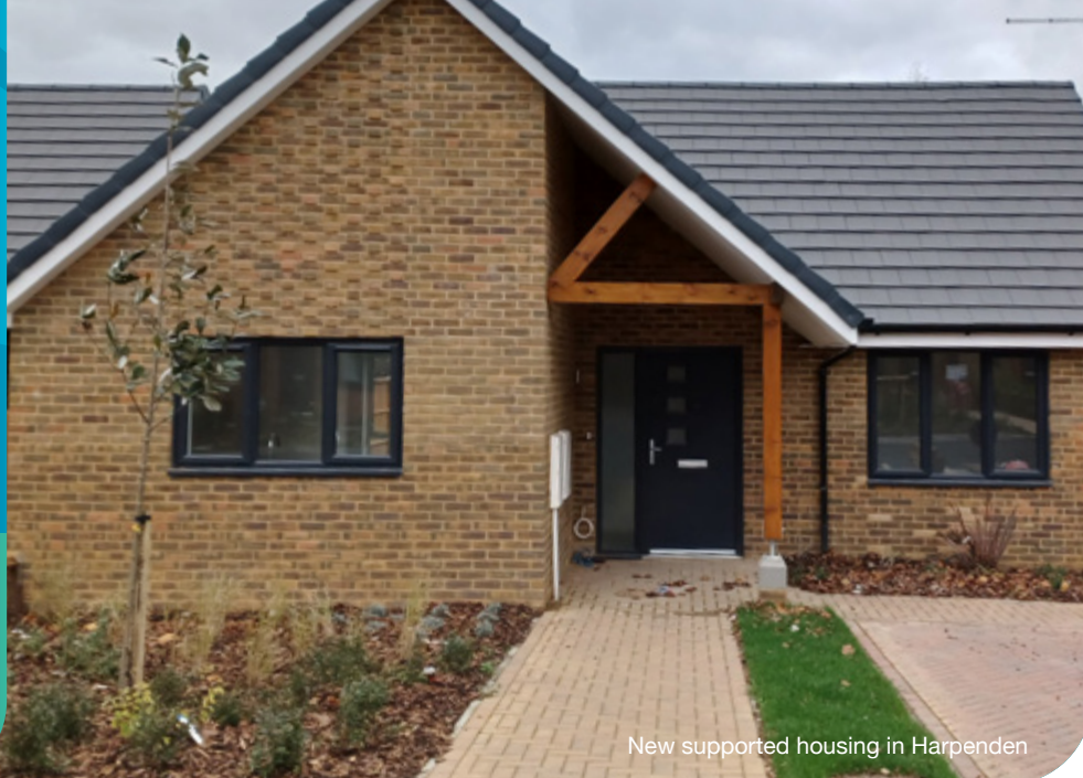
New supported housing in Harpenden