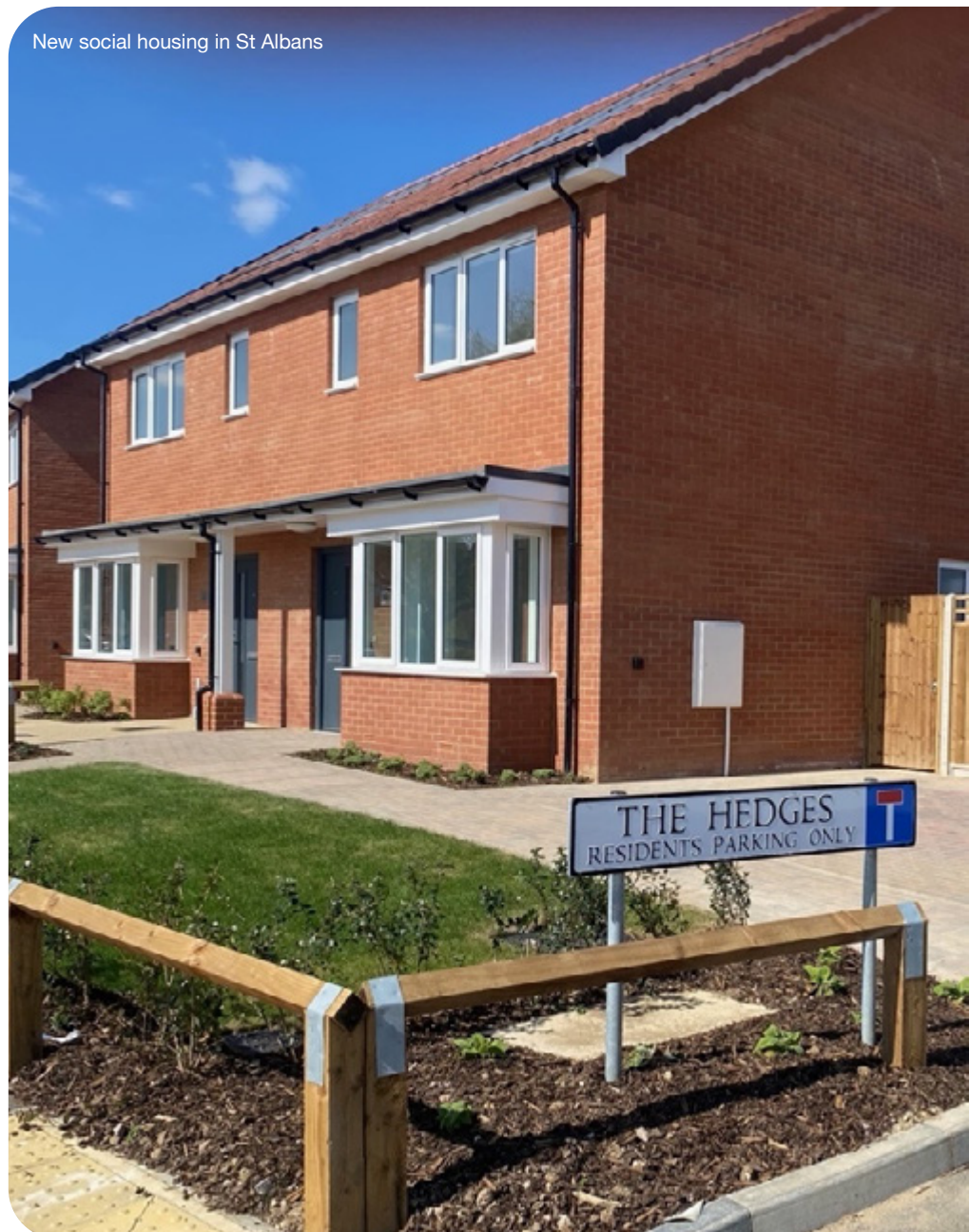
New social housing in St Albans

We will, as ever, support residents facing homelessness through our dedicated support services and work with our partners to support new refugees in our community. In 2025 we will refresh our Homelessness Strategy.