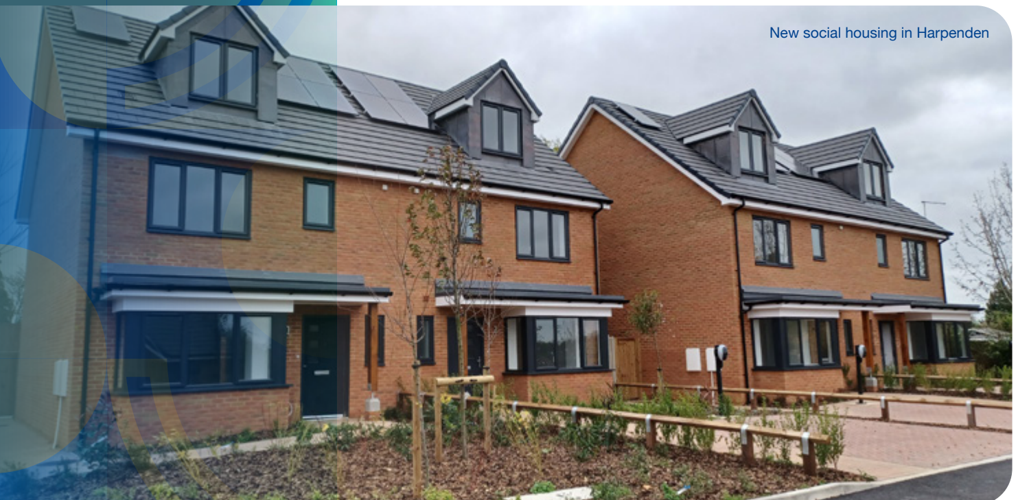
New social housing in Harpenden

We also want to ensure that all our existing Council-owned homes are warm, dry and energy efficient. By 2030 we anticipate all will have an energy rating of C or above, ready for when the grid becomes fully carbon neutral. The Council has made good use of Government funding from the Green Homes Deal and Social Housing Decarbonisation Fund to improve energy efficiency and lower carbon emissions in Council-owned homes and buildings. Our Housing Energy Strategy sets out how we will make bids for future funding opportunities.