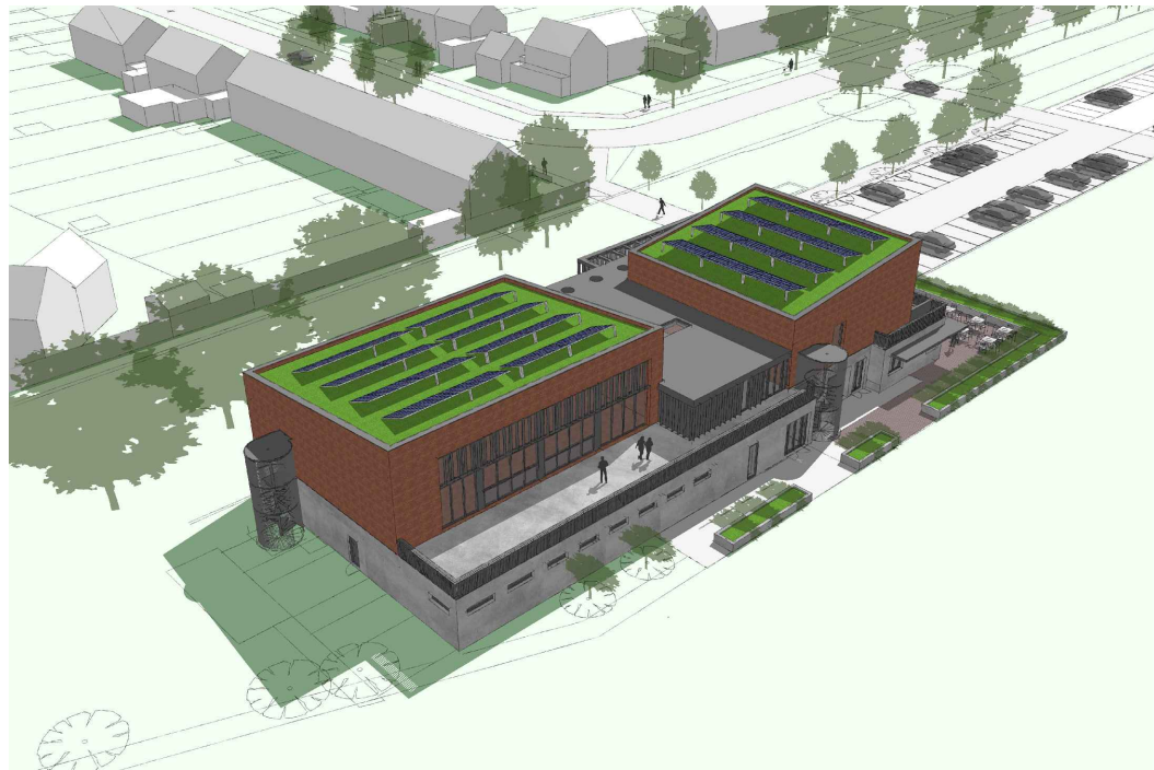
3 Proposed North Aerial