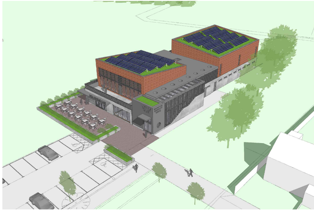
1 Proposed South Aerial