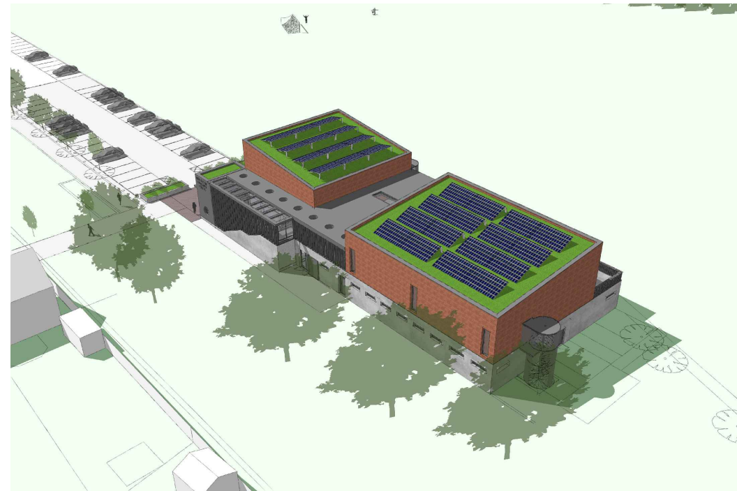
4 Proposed East Aerial