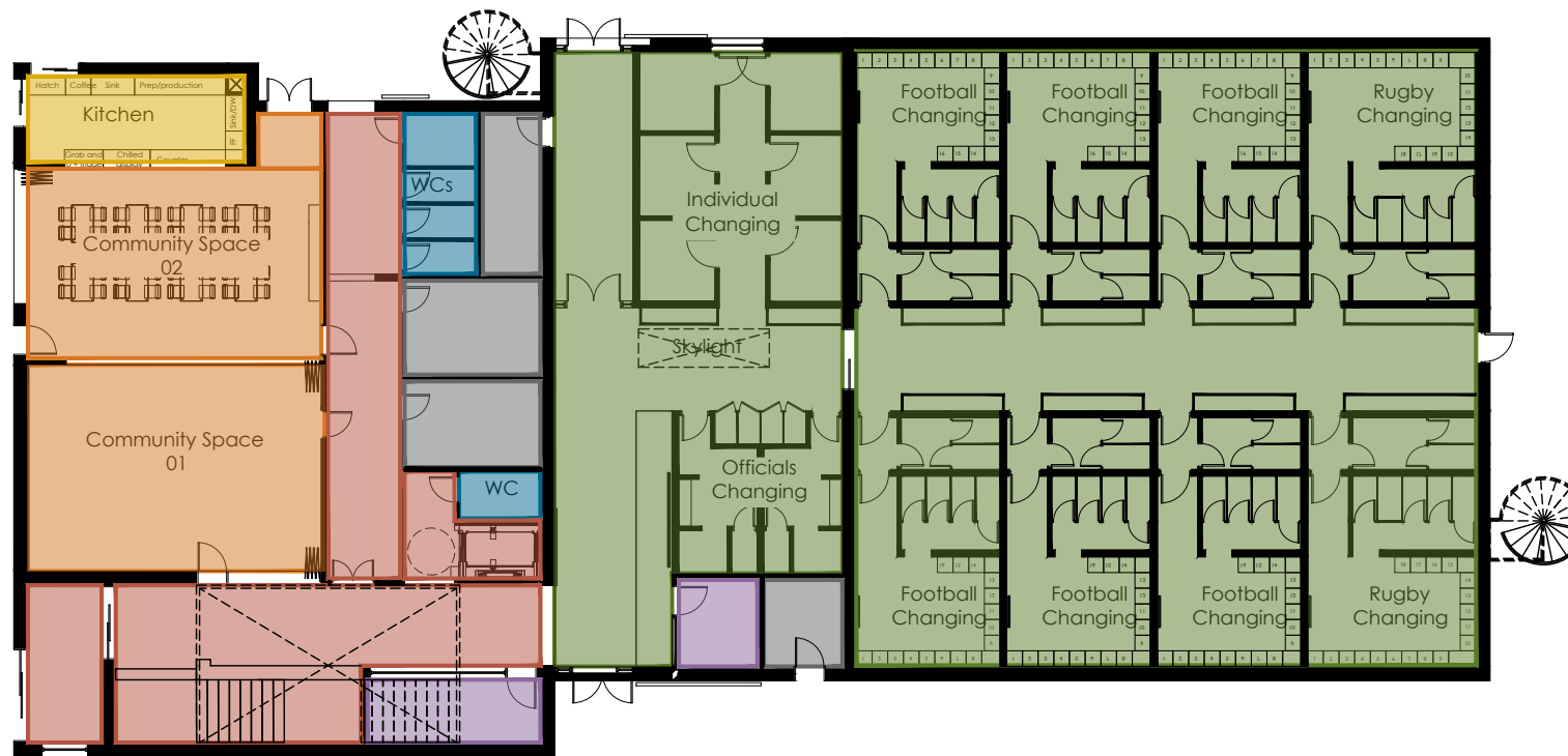
1 Ground Floor